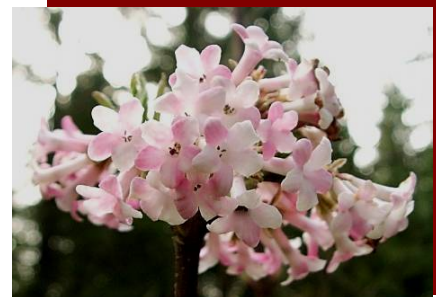
Above, V. x bodnantense Dawn Viburnum blooms in the winter

As you can see, viburnums provide a wide variety of characteristics. If you select a viburnum for your yard, be sure to pick one that meets your requirements. Large or small, evergreen or deciduous, tasty or yucky, there is one out there for you.