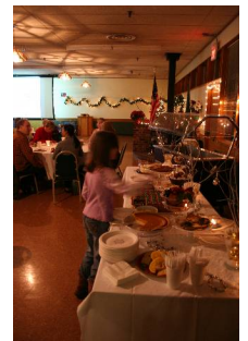
Cakes, cookies and pies. Oh my!

Christmas and his elves; and the Tahoma Middle School choir added to the fun evening held at the arboretum and Lake Wilderness Lodge.