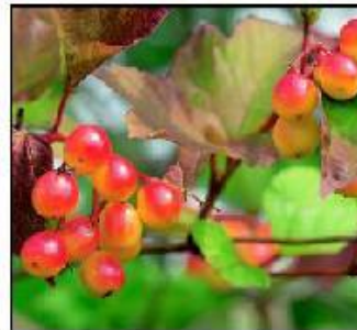
Above V. Trilobum , American Highbush Cranberry, tasty Right V. Edule , Squashberry, even tast-

highbush cranberry. As it turns out, like a lot of common names, this common name is applied at various times, by various people, to more than one species. In this case, Viburnum opulus , or European highbush cranberry (the bad tastin' stuff); V. trilobum , American highbush cranberry (the good tastin'