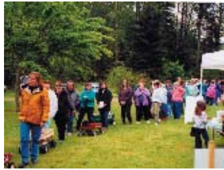
Early shoppers wait in line for the 10am opening.