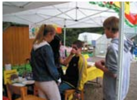
Fun activities for kids were available along with a Miniature Garden Contest.