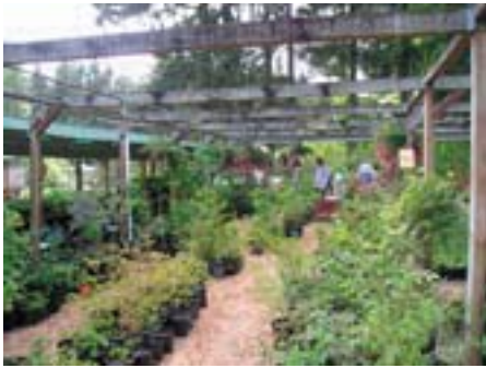
The plants are ready and waiting to go to new homes..