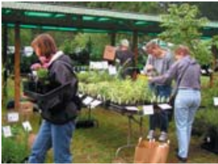
Decisions, decisions! Shoppers have so many choices!