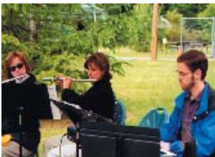
One of music groups that entertained during the sale.