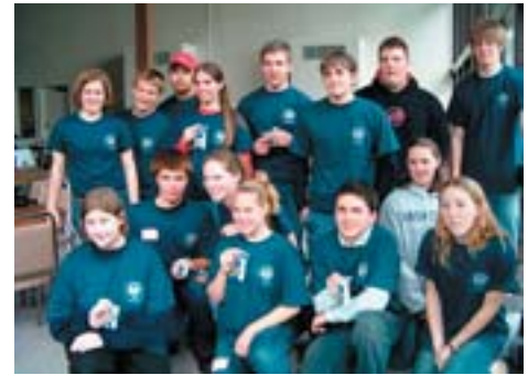
After the competition, it was “photo time” for members of the winning teams.

The NW Regional Envirothon, sponsored by the Canon Corporation and hosted by the King Conservation District, was held at Lake Wilderness Arboretum and Park on March 22nd. The Envirothon is a problem-solving, natural resource competition for high school students (grades 9 through 12). Students visited five “in-the-field” test stations that were set up in the Arboretum, Lake Wilderness Lodge and Park where written and hands-on problem solving was required along with a strategy for public awareness. Winning teams from the local and regional competitions will compete in a state Envirothon competition, and the international competition will be held at Wesleyan College in Buckhannon, West Virginia in late July. Eleven teams, including four from Tahoma HS, represented the Puget Sound area at this year’s competition.