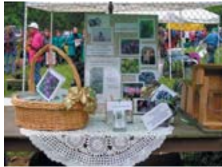
Just one of the many unique vendor's booths.