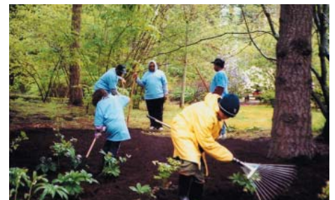
Boeing and SKCAF volunteers add bark in the hellebore area.

The entire SM Garden was weeded and spruced up. Mulch was spread and some plants were added to add interest to the garden. An area in the display gardens that had grown very shady over the years and had reverted to salal was brushed out and planted with many of the shade loving plants from Loie Benedict's garden. The area was transformed in a few hours to a lovely shady walk. In another area of the display garden where the sun was good, we added a peony display including several of Loie's peonies. In years to come, we hope to add additional specimens. As these plants get established, they'll be putting on quite a show.