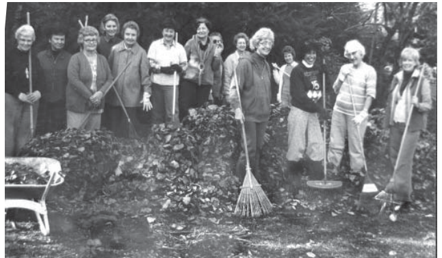
In October 1981, Maple Trails Garden Club hosted several other Chinook District Garden Clubs in a Leaf Raking Party.

The Maple Trails Garden Club felt the entrance needed an inviting look and spent many hours (husbands sometimes helping) on an entrance beautification project - planting rhododendrons and native plants, as well as building the raised berm areas, tables, signs and some trails. Their club, still very active at the Arboretum, holds monthly work parties, second Wednesdays at 9:30am.